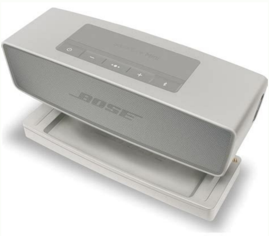
How to hard reset Bose SoundLink Mini. How to reset Bose SoundLink Mini not charging.